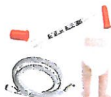
Medical & Personal Hygiene