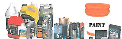
Household Hazardous Waste* (do not recycle empty hazardous waste containers, except empty aerosol cans)

*Other recycling options available, visit RecycleSpot.org