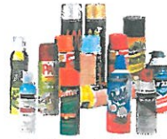
Aerosol Cans (empty only, make no "hiss" sound)