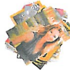
Magazines & Catalogs