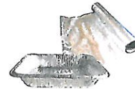
Aluminum Foil & Pans