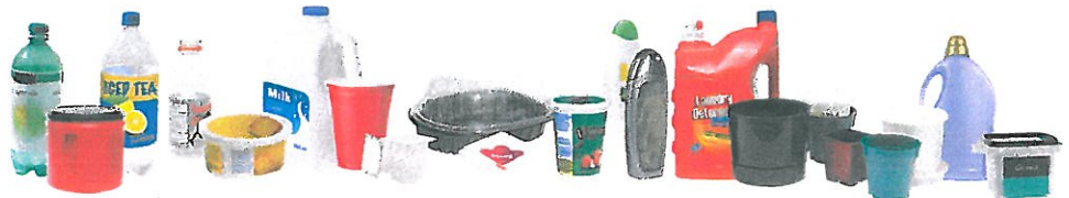
Plastic Bottles & Containers (have #1 - #7 inside arrow symbol on container)