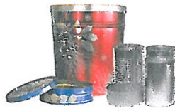
Steel (tin) Cans