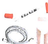
Medical & Personal Hygiene